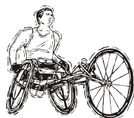
Track, Field and Boccia Clubs