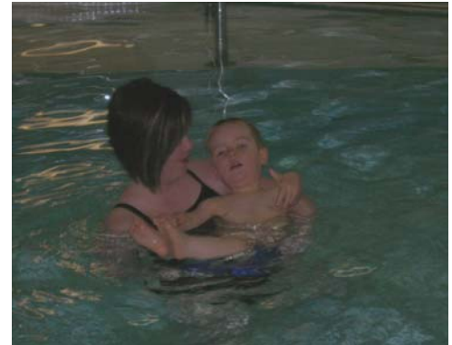
Enjoying the L'il Splashers Therapy Swim