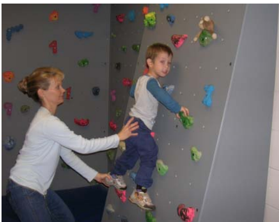
Developing new skills on the Climbing Wall provided by funds raised through the Festival of Trees