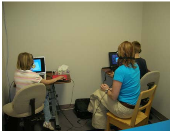
Sarnia Street Machines sponsor the “Fast Forward” Listening Program at Pathways