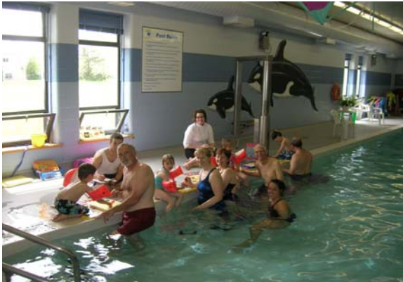
“Hand Writing Without Tears” staff and volunteers work with clients in the pool