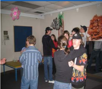
“FRIDAY NIGHT JUNCTION” TEEN DANCE