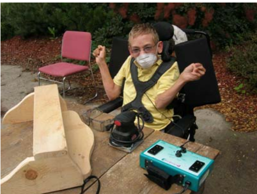
The Barnboard Woodworking Club paid it forward this year, donating funds from their annual sale to Harmony